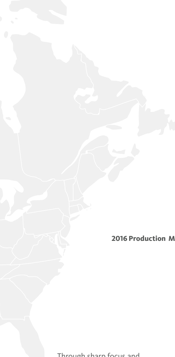
2016 Production Mix