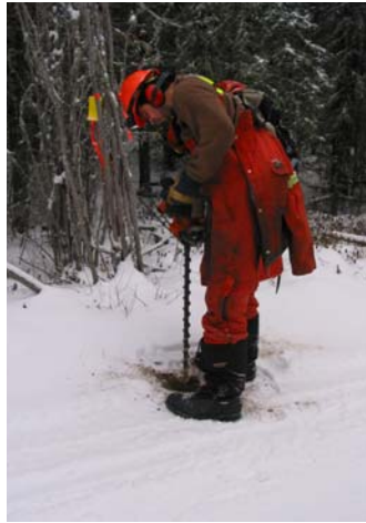
Recording crew worker drilling geophone hole

Line locations were pre-flagged by surveyors using pre-plot coordinates derived from the survey design. GPS kept pre-flaggers on line with instructions to avoid - to the extent possible - stands of merchantable timber, water bodies such as beaver dams, or topography not conducive to small vehicular travel.