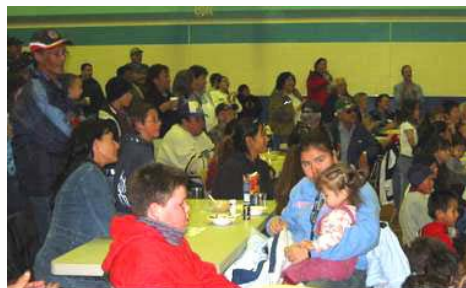
Janvier event at Father Perin School