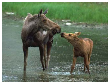
Moose studied in wildlife monitoring program

In the winter of 2003/2004 Devon undertook a wildlife monitoring program to assess the effects of geophysical and exploration well drilling on woodland caribou, moose, fisher, lynx, coyote and deer. The study compared the response of wildlife species in the active seismic clearing and well drilling to older activities conducted by another adjacent operator and a control area north of Christina Lake. Aside from woodland caribou, the other species did not avoid high use linear features. A local member of the community, acting as an assistant, made a significant contribution to the study. Details of the study are presented in the SIR.