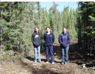
Cut line—April 2003

During the winter of 2002/2003, Devon Canada conducted a high-